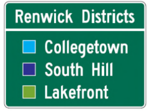
Boundary Informational Sign